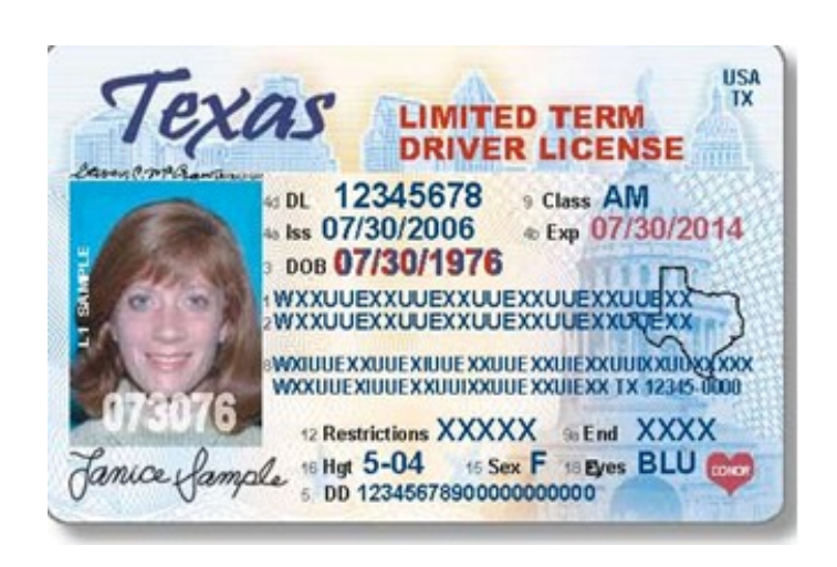
Horizontal Orientation (Age 21 & above)

All existing Temporary Visitor cards will remain valid until the Temporary Visitor Status expiration date provided on the card. Upon expiration, a new Limited Term card will be issued to the customer.