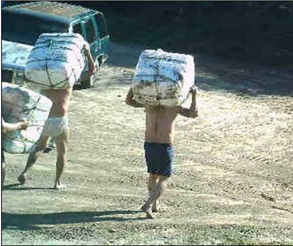
(U) Fig. 6. Image of illegal aliens attempting to carry loads of marijuana across the Texas-Mexico border.

(U) Some alien smuggling organizations have been reported to force or recruit illegal aliens to perform labor, including working as drug mules. 56 It is difficult to evaluate how frequently illegal aliens involved in drug trafficking were coerced or forced, and it is likely that some apprehended illegal alien drug traffickers falsely claim that they were forced to carry drugs in an effort to avoid prosecution on drug charges.