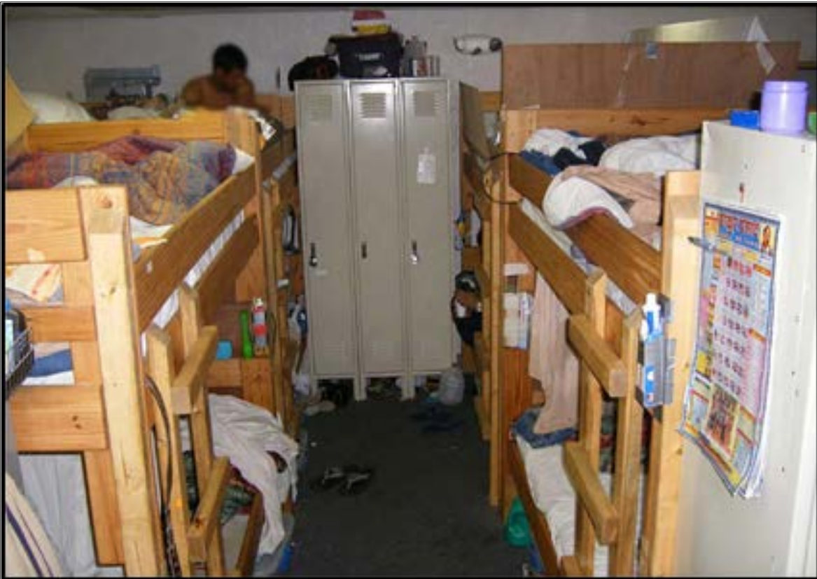
(U) Fig. 5. Image of the tight living quarters persons had to endure while working for their trafficker.

(U) In August 2013, two defendants were charged for willfully and knowingly falsifying statements made on government documents from June 2012 to November 2012. They submitted an incomplete list of employees and made false statements to the Department of Labor as to the identity and number of people employed at an identified business in Porter, Texas. The defendants were also charged with one count of engaging in threats and intimidation in order to prevent or delay people from testifying. 55