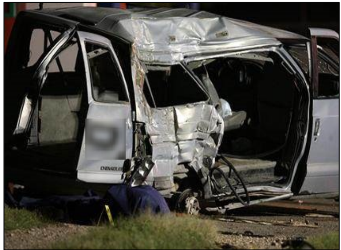
(U) Fig. 11. Image of a van rollover driven by a 15-year-old juvenile during a human smuggling attempt in Palmview, Texas, April 2012.

(U) On April 10, 2012, an illegal alien smuggler rolled a van suspected of carrying illegal immigrants near Palmview, Texas, when the smuggler attempted to elude US Border Patrol. Nine people died and six others were injured. Seven suspected smugglers, including the 15-year-old driver of the van, were arrested. Further investigation lead to the discovery of a stash house and 12 additional illegal aliens were taken into custody. 100